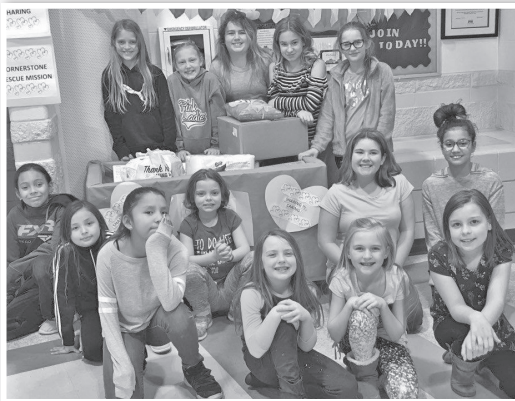
Valley View Elementary Student Council members

During the month of February the Valley View Elementary Student Council did their Share The Love fundraiser and blessed Cornerstone with the proceeds. For this event the student council students sold suckers and the staff donated their Friday jeans day money. Altogether they raised $650. In addition, the whole school collected many grocery and personal care items for us. We thank Valley View Elementary for "Sharing The Love" with Cornerstone!